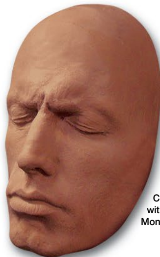
Clay lifecast poured with Premium Grade Monster Clay

The Monster Makers, Inc. 13957 West Parkway Rd. Cleveland, OH 44135 www.monstermakers.com Phone: 216.671.8700